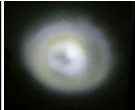
Big lantern head 12 feet