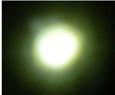
Big lantern head 6 feet