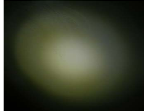
Small lantern head 6 feet