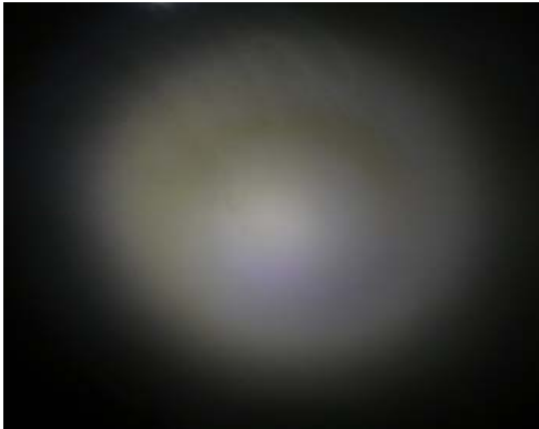
Small lantern head 6 feet