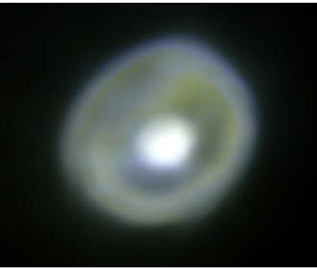
Big lantern head 6 feet